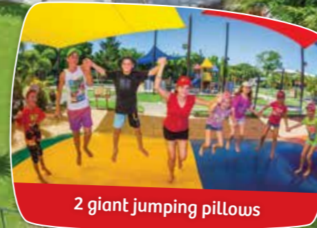
2 giant jumping pillows