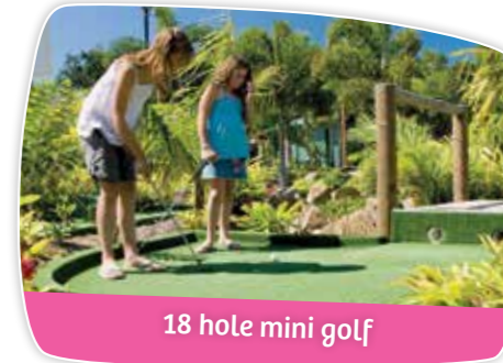
18 hole mini golf