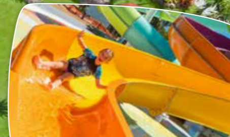
Big, huge, mega waterslide park