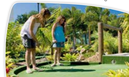
18 hole mini golf