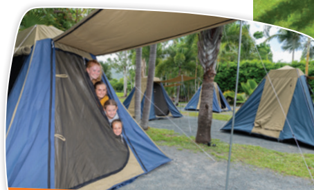
Powered Camp Sites