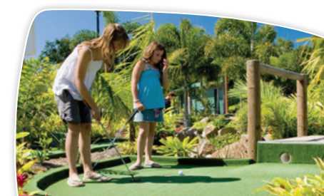
18 hole mini golf