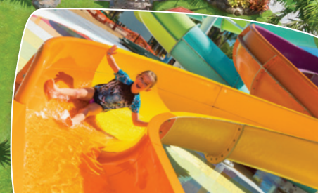
Big, huge, mega waterslide park