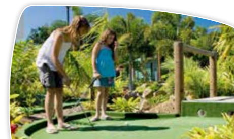
18 hole mini golf