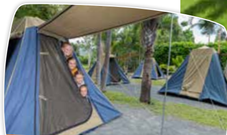
Powered Camp Sites