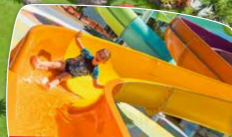
Big, huge, mega waterslide park