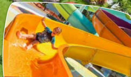
Big, huge, mega waterslide park