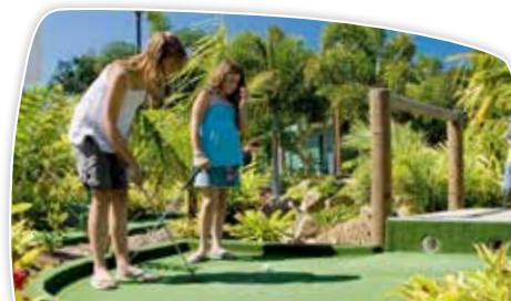
18 hole mini golf