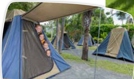
Powered Camp Sites